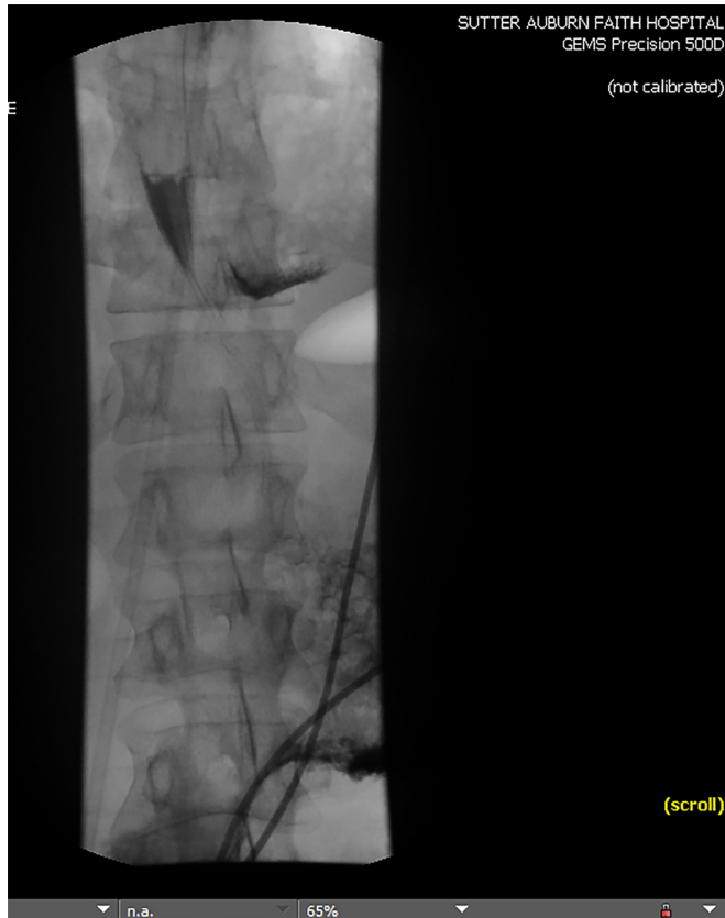
Figure 2 Upper gastrointestinal tract showing contrast outside the lumen of his oesophagus and along the contour of the diaphragm on the left side.

thoracotomy with total pulmonary decortication, primary repair of the distal oesophageal perforation, mediastinal debridement, intercostal muscle flap pedicle based on intercostal artery, open surgical gastrostomy tube placement and surgical jejunostomy tube placement. Four days postoperatively, anterior chest tubes were removed. Posterior chest tubes were removed after 6 days. Unfortunately he developed a recurrent effusion and chest tubes were reinserted by interventional radiology. A repeat oesophagram showed a persistent leak. At that point there was discussion of oesophageal stent placement versus conservative treatment. The runner elected for conservative management.